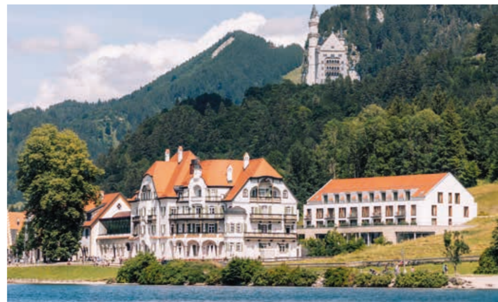
ALPENROSE AM SEE Culinary enjoyment with an impressive view of the Alpsee.

Alpenrose, with its traditional architecture and uninterrupted view of the Alpsee, offers a unique setting for weddings, family gatherings, and select gala dinners (10-86 persons).