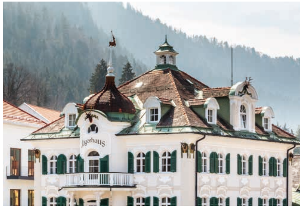
AMERON Neuschwanstein Alpsee Resort & Spa resurrects a traditional ensemble of buildings.