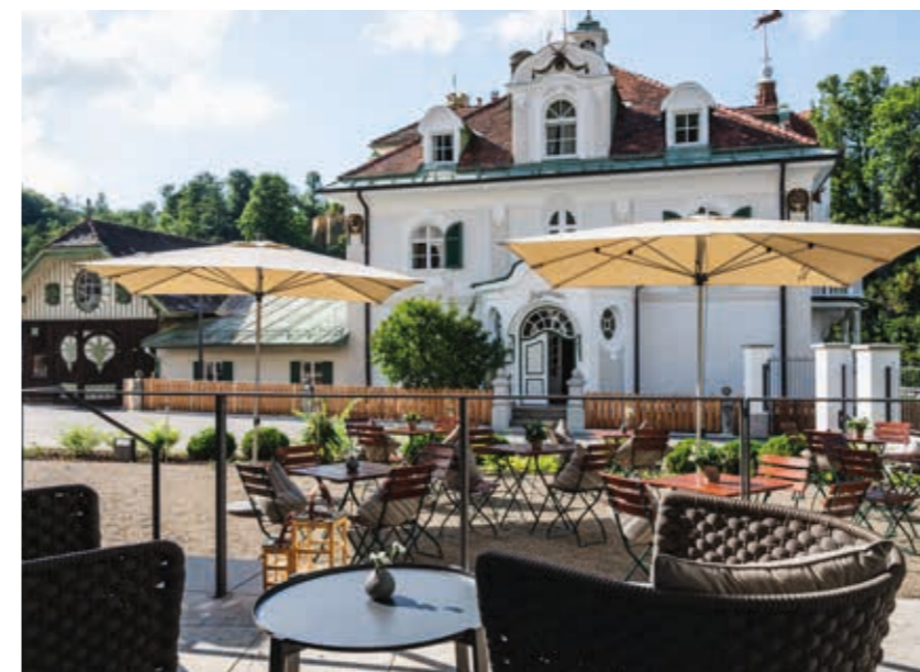
LUDWIG BAR “Classic meets Bavaria” A fine choice of drinks and local creations.

So that you can fully enjoy the exquisite flavours of our dishes in your own private place, we will gladly provide you with meals from the Ludwig Bar as room service.