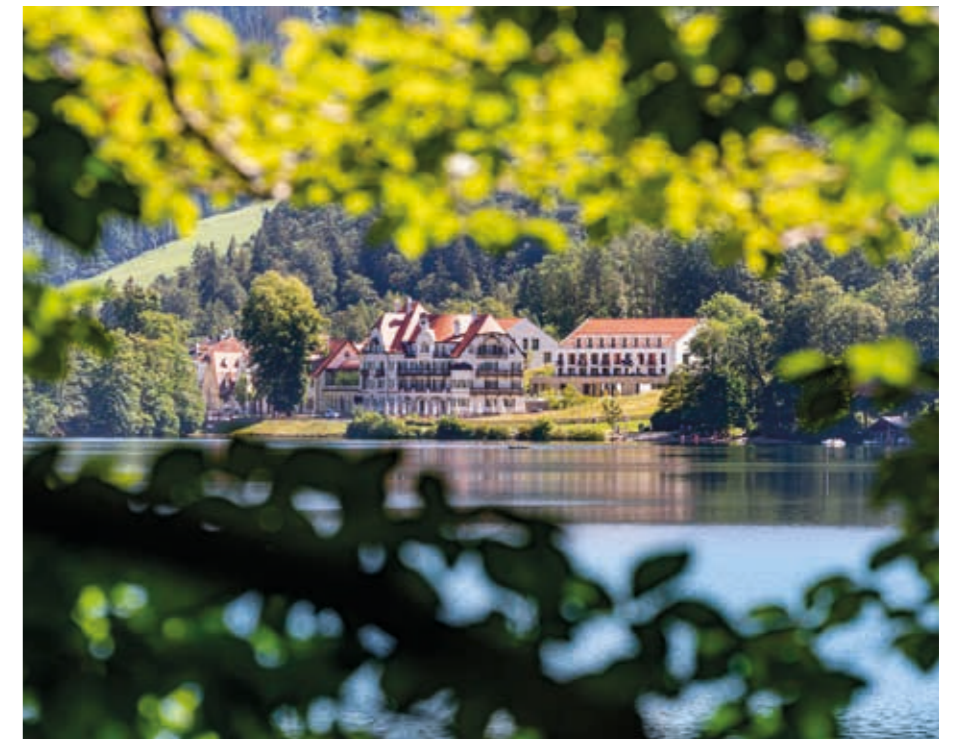
The traditional residence Alpenrose, situated directly on the shore of the Alpsee at the foot of both royal castles Hohenschwangau and Neuschwanstein.