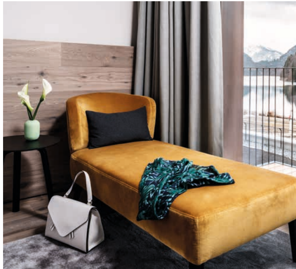
The new look AMERON Neuschwanstein Alpsee Resort & Spa follows the concept of balanced contrasts.