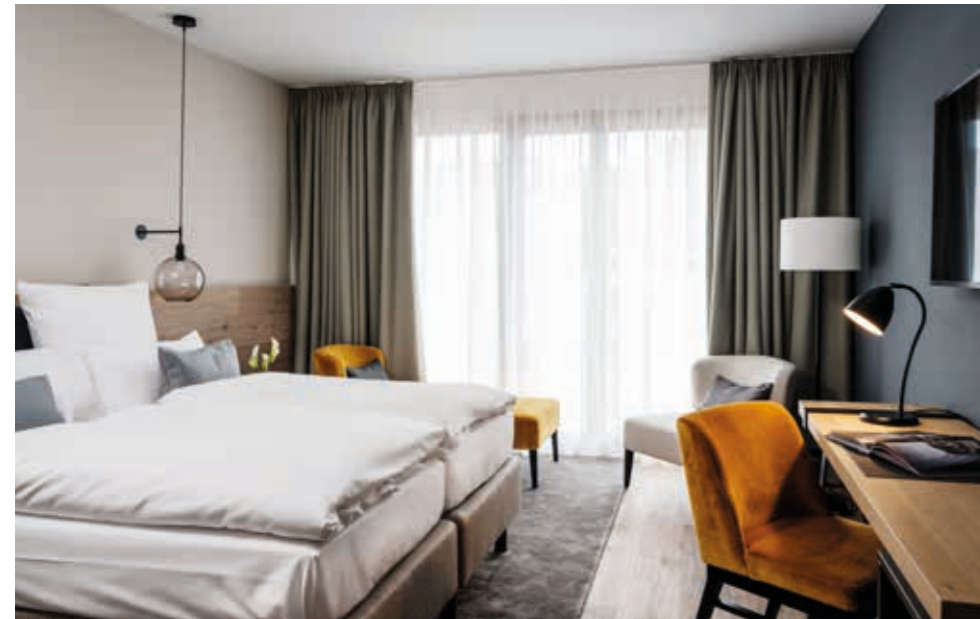
136 rooms and junior suites, 4 conference rooms, 1 ballroom, 3 event areas, restaurants, Ludwig Bar, 4 elements spa.